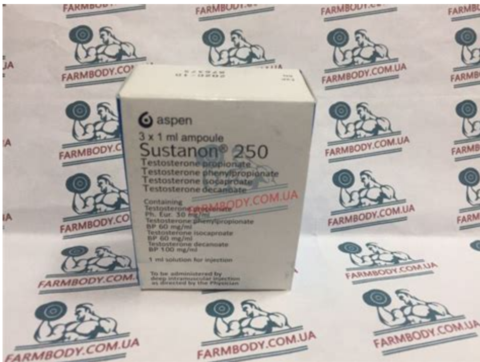
Anavar/Primo Cycle Advice.

First off, first post so..whats up guys. Been following the board for a while and hands down best site there is. I was planning on doing an Anavar and Primo Cycle for 12 weeks. Primo 400mgs/week. Anavar 60-80mgs/week. This will be my first real cycle in the last 4 years (ran test only for 8 weeks with decent results.) Wk: 1-16 Primo 500mg (homebrew, very good quality, Primo needs to be run at least 12 weeks to see any results at 500mg or more) Wk: 1-6 Anavar 50mg-100mg (want to front load it because orals come in quicker and to kick off the cycle) 02-03-2011, 05:59 PM #4. lex57.