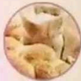
Wheat Flour Foods