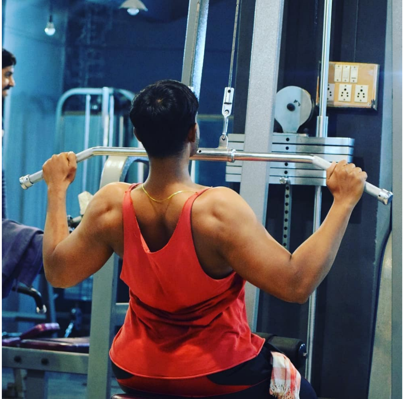
In this article, we look at the benefits of vitamin D, what happens to the body when people do not get enough, and how to boost vitamin D intake. #Trt #testosterone #tshot #hormonebalance #hormones #testosteronereplacementtherapy #testosteronebooster #testosteronetherapy #hcg #onsteroids #mentalhealthawareness #mensfashion #mentalhealthmatters #testosteron #igfl #peptide #peptidetherapy #sermorelintherapy #ipamorelin #gac #gacinjections #bcaa