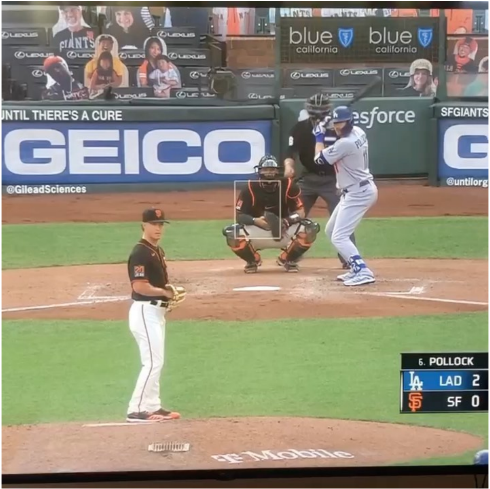
#legday #platinumfitness #949 power lifting #strong island #squat #power lifting #strength #fitness motivation #buildyourselftohelp build others #growtogether #home #where it all began #bethechange #staymotivated #staygolden #boom

http://enantestoviron.over-blog.com/2020/09/buy-bayer-proviron-uk.html