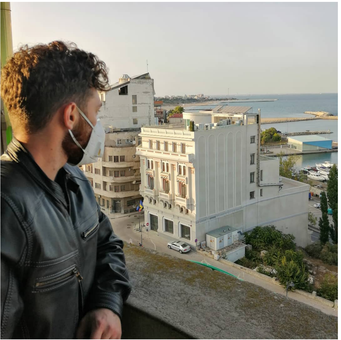
#photography#captionplus #baby #girls #instapic #lol #motivation #lifestyle #christmas #cool #gym #wedding #funny #workout #handmade #healthy #pink #yummy #flowers #drawing #fit #black #work #blackandwhite #party #design #night #instafood #blue 937