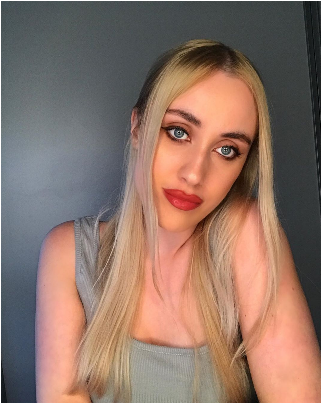
@dodreams @dodreams_en #두드림성형외과 #Dodream #PlasticSurgery #Filer #Botox #Lifting #Eyesurgery #Nosesurgery #Rhinoplasty #Breastsurgery #Liposuction #Lifting #koreanplasticsurgery #DodreamPlasticSurgery #Petite #Koreanbeauty