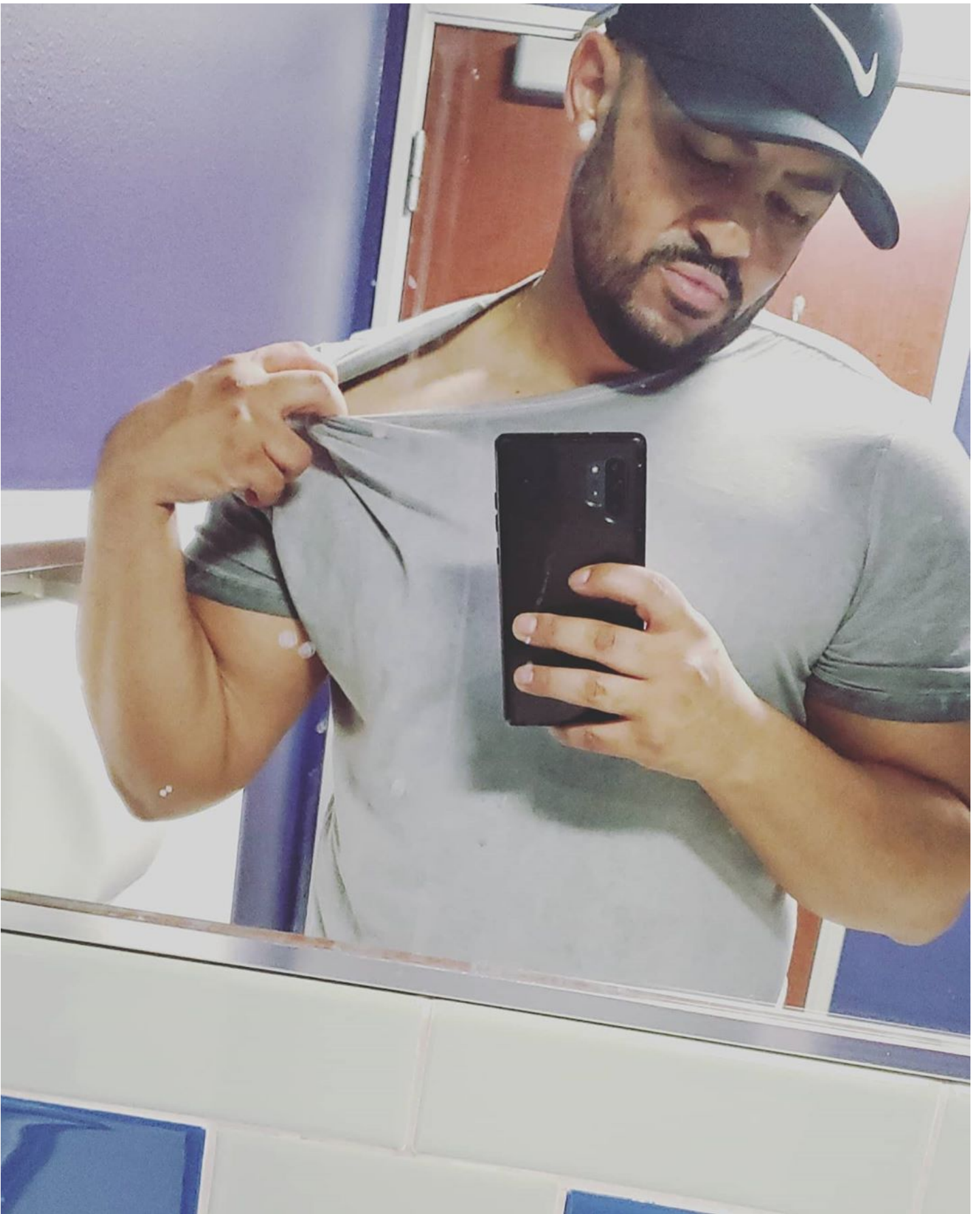
Good things take time. "I'm 97% sure you don't like me but I'm 100% sure I don't care." Follow: @singeallan